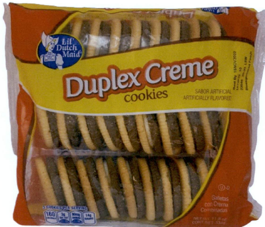
Figure 1. Unregistered LIL DUTCH MAID Duplex Creme Cookies

The Food and Drug Administration (FDA) warns all healthcare professionals and the general public NOT TO PURCHASE AND CONSUME the unregistered food product: