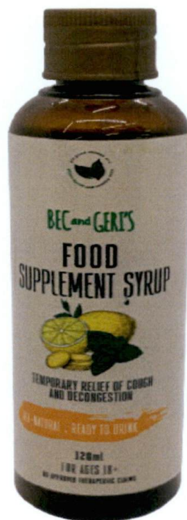
Figure 1. Unregistered BEC AND GERI'S Food Supplement Syrup (NO APPROVED THERAPEUTIC CLAIMS)

The Food and Drug Administration (FDA) warns all healthcare professionals and the general public NOT TO PURCHASE AND CONSUME the unregistered food supplement: