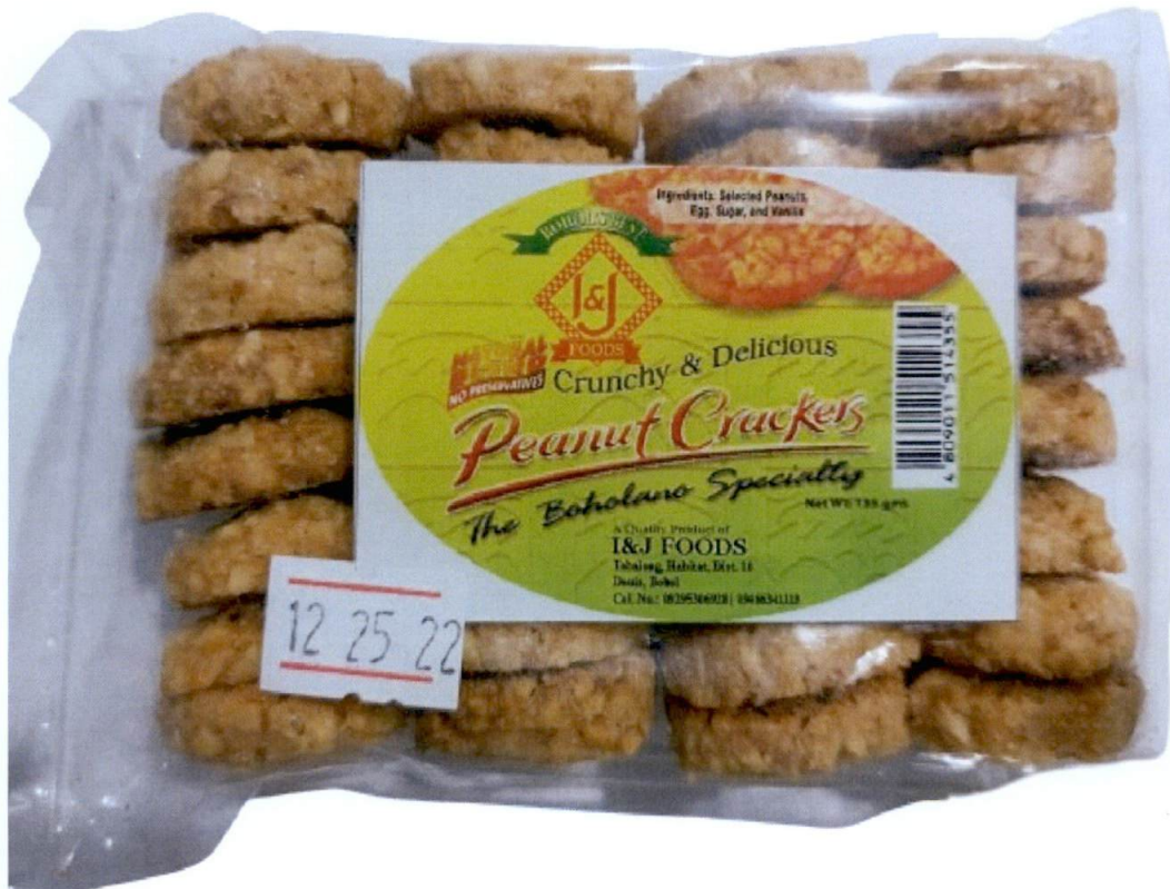
Figure 1. Unregistered I & J FOODS Peanut Crackers

The Food and Drug Administration (FDA) warns all healthcare professionals and the general public NOT TO PURCHASE AND CONSUME the unregistered food product: