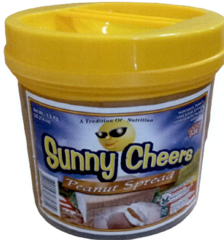
Figure 1. Unregistered SUNNY CHEERS Peanut Spread

The Food and Drug Administration (FDA) warns all healthcare professionals and the general public NOT TO PURCHASE AND CONSUME the unregistered food product: