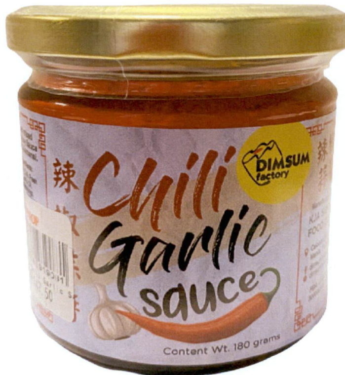
Figure 1. Unregistered DIMSUM FACTORY Chili Garlic Sauce

The Food and Drug Administration (FDA) warns all healthcare professionals and the general public NOT TO PURCHASE AND CONSUME the unregistered food product: