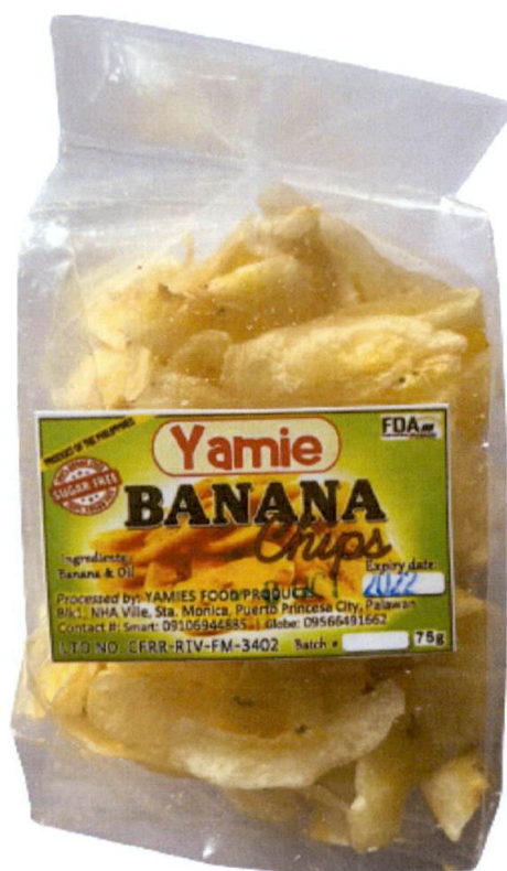
Figure 1. Unregistered YAMIE Banana Chips

The Food and Drug Administration (FDA) warns all healthcare professionals and the general public NOT TO PURCHASE AND CONSUME the unregistered food product: