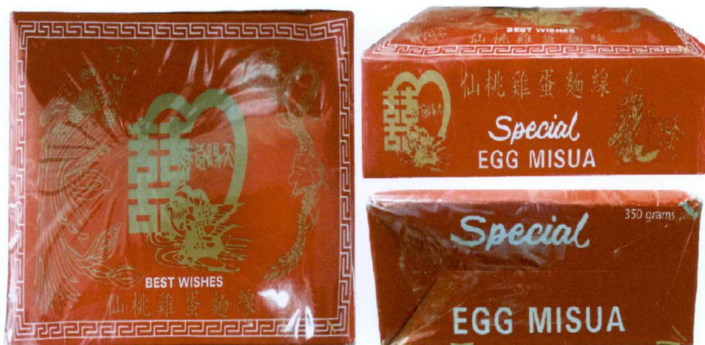
Figure 1. Unregistered UNBRANDED Special Egg Misua

The Food and Drug Administration (FDA) warns all healthcare professionals and the general public NOT TO PURCHASE AND CONSUME the unregistered food product: