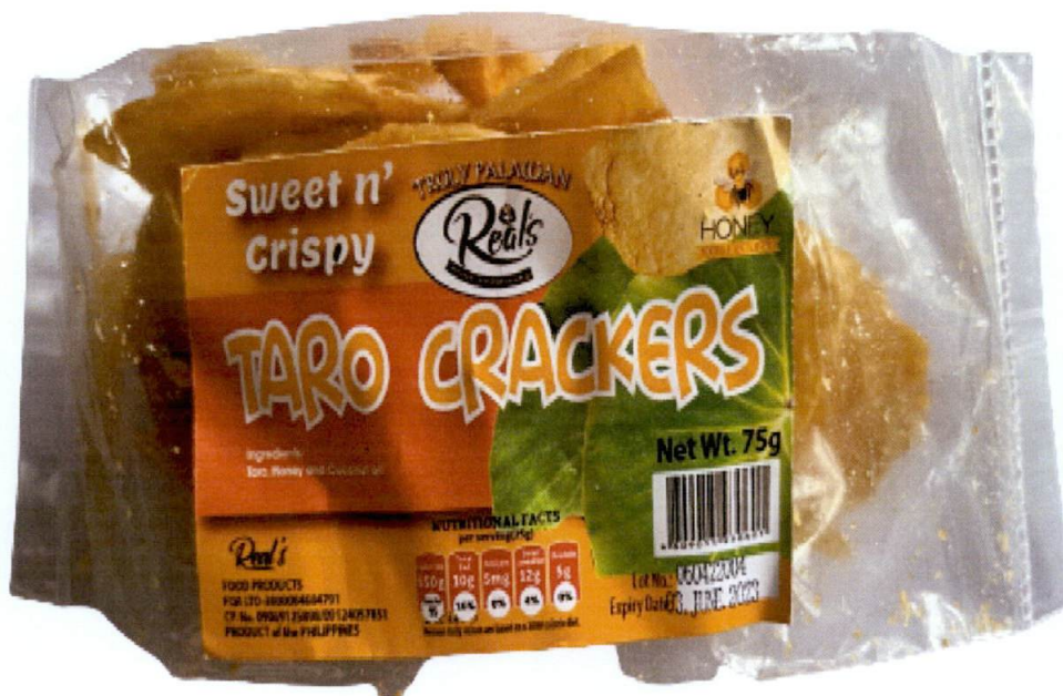
Figure 1. Unregistered REAL'S Taro Crackers Sweet n' Crispy

The Food and Drug Administration (FDA) warns all healthcare professionals and the general public NOT TO PURCHASE AND CONSUME the unregistered food product: