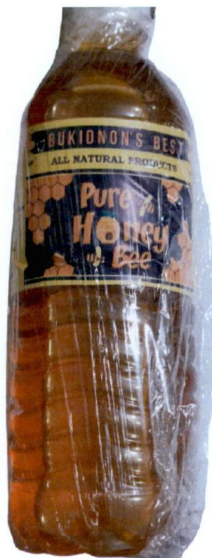
Figure 1. Unregistered BUKIDNON'S BEST Pure Honey Bee

The Food and Drug Administration (FDA) warns all healthcare professionals and the general public NOT TO PURCHASE AND CONSUME the unregistered food product: