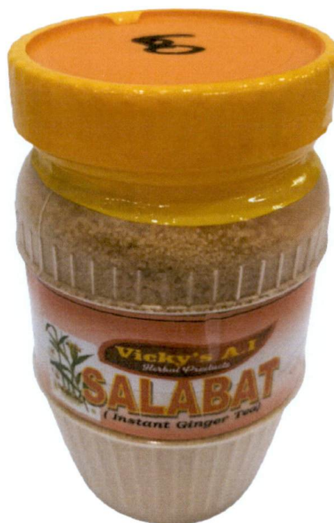
Figure 1. Unregistered VICKY'S A.I HERBAL PRODUCTS Salabat (Instant Ginger Tea)

The Food and Drug Administration (FDA) warns all healthcare professionals and the general public NOT TO PURCHASE AND CONSUME the unregistered food product: