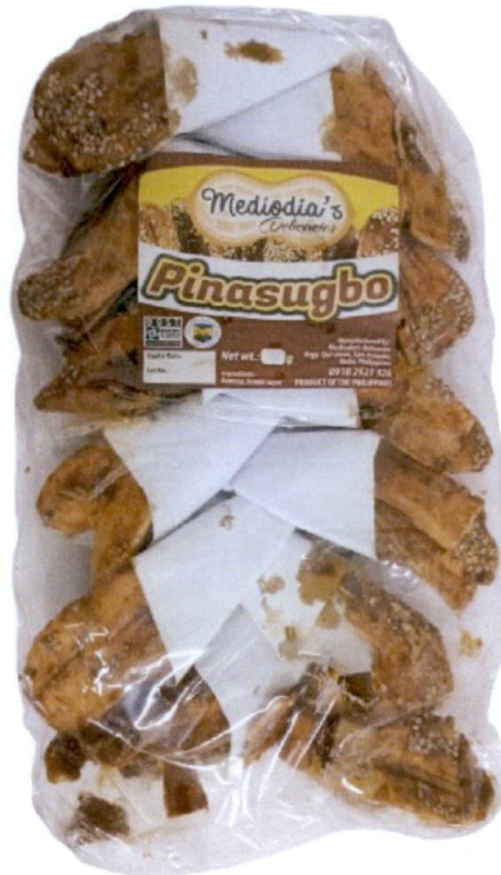
Figure 1. Unregistered MEDIODIA'S DELICACIES Pinasugbo

The Food and Drug Administration (FDA) warns all healthcare professionals and the general public NOT TO PURCHASE AND CONSUME the unregistered food product: