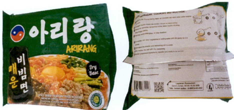
Figure 1. Unregistered ARIRANG Spicy Bibim Ramyun Fried Noodle

The Food and Drug Administration (FDA) warns all healthcare professionals and the general public NOT TO PURCHASE AND CONSUME the unregistered food product: