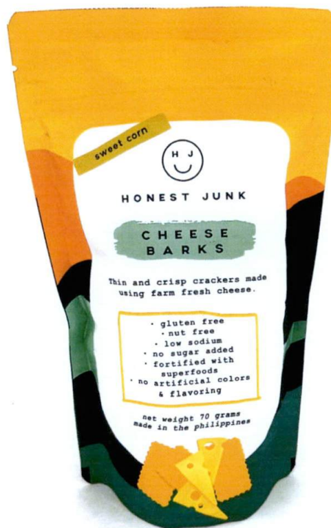
Figure 1. Unregistered HONEST JUNK Sweet Corn Cheese Barks (thin and crisp crackers made using farm fresh cheese)

The Food and Drug Administration (FDA) warns all healthcare professionals and the general public NOT TO PURCHASE AND CONSUME the unregistered food product: