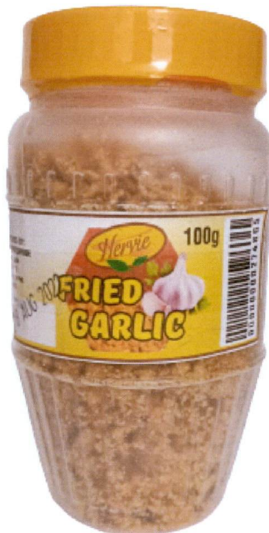
Figure 1. Unregistered HERVIE Fried Garlic

The Food and Drug Administration (FDA) warns all healthcare professionals and the general public NOT TO PURCHASE AND CONSUME the unregistered food product: