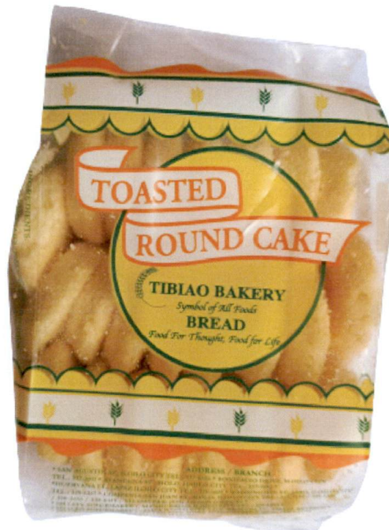
Figure 1. Unregistered TIBIAO BAKERY Toasted Round Cake

The Food and Drug Administration (FDA) warns all healthcare professionals and the general public NOT TO PURCHASE AND CONSUME the unregistered food product: