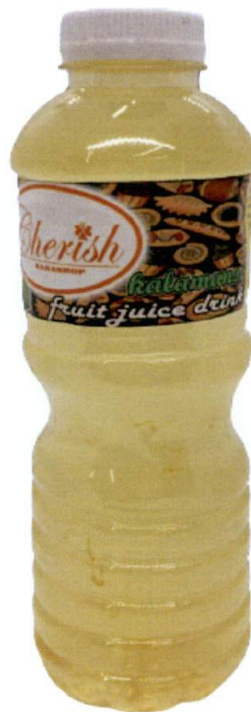
Figure 1. Unregistered CHERISH BAKESHOP Kalamansi Fruit Juice Drink

The Food and Drug Administration (FDA) warns all healthcare professionals and the general public NOT TO PURCHASE AND CONSUME the unregistered food product: