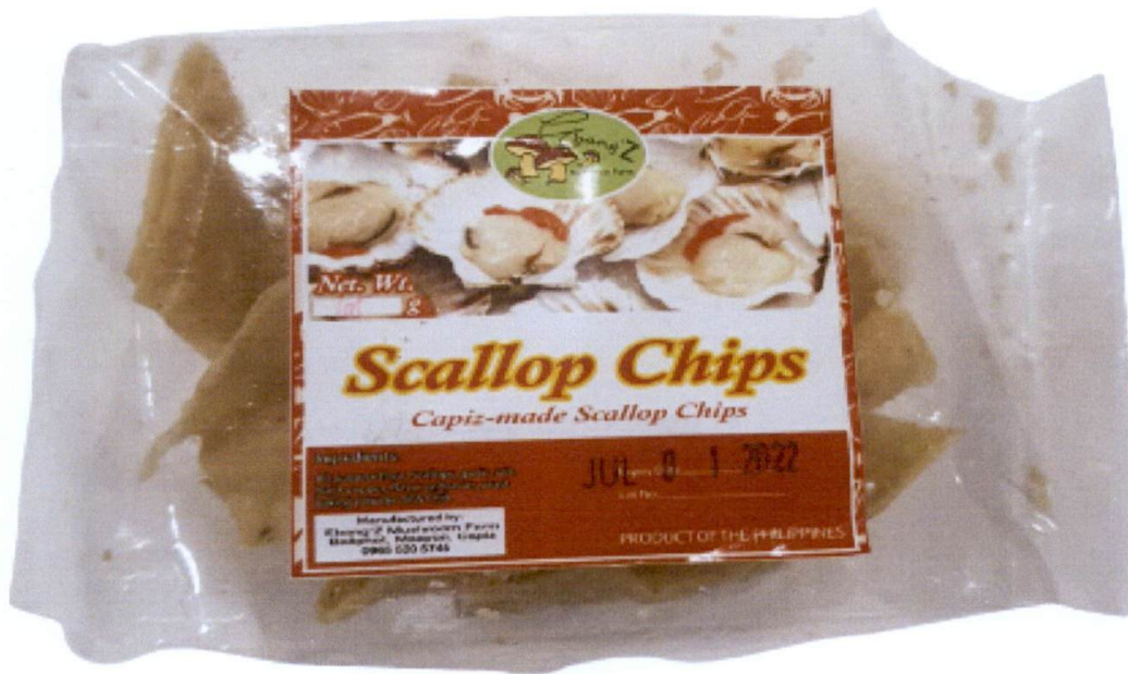
Figure 1. Unregistered UNBRANDED Scallop Chips - Capiz-made Scallop Chips

The Food and Drug Administration (FDA) warns all healthcare professionals and the general public NOT TO PURCHASE AND CONSUME the unregistered food product: