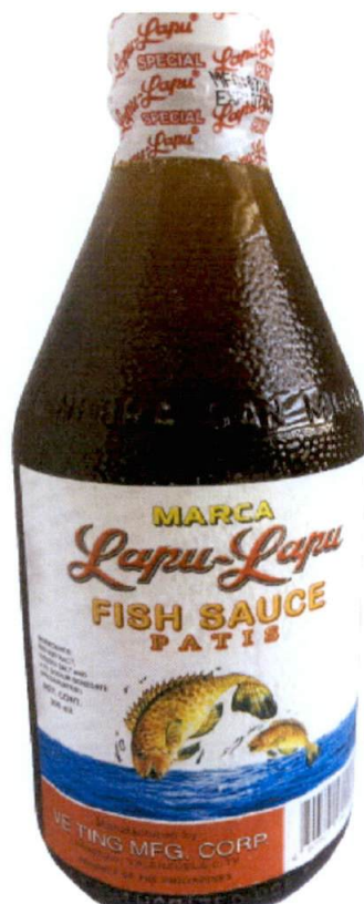
Figure 1. Unregistered MARCA LAPU-LAPU Fish Sauce Patis

The Food and Drug Administration (FDA) warns all healthcare professionals and the general public NOT TO PURCHASE AND CONSUME the unregistered food product: