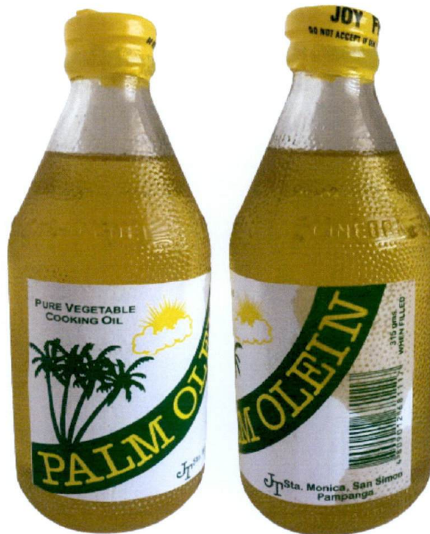
Figure 1. Unregistered PALM OLEIN Pure Vegetable Cooking Oil

The Food and Drug Administration (FDA) warns all healthcare professionals and the general public NOT TO PURCHASE AND CONSUME the unregistered food product: