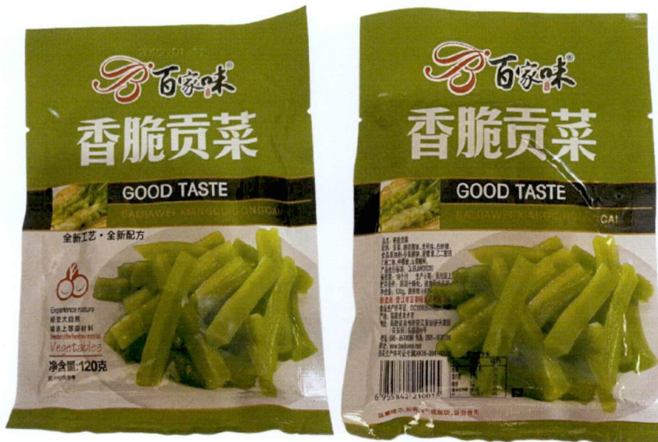
Figure 1. Unregistered GOOD TASTE BAIJIAWEI XIANGCUIGONGCAI String-Like Vegetable Food Product in Green and White Packaging (In Foreign Language)

The Food and Drug Administration (FDA) warns all healthcare professionals and the general public NOT TO PURCHASE AND CONSUME the unregistered food product: