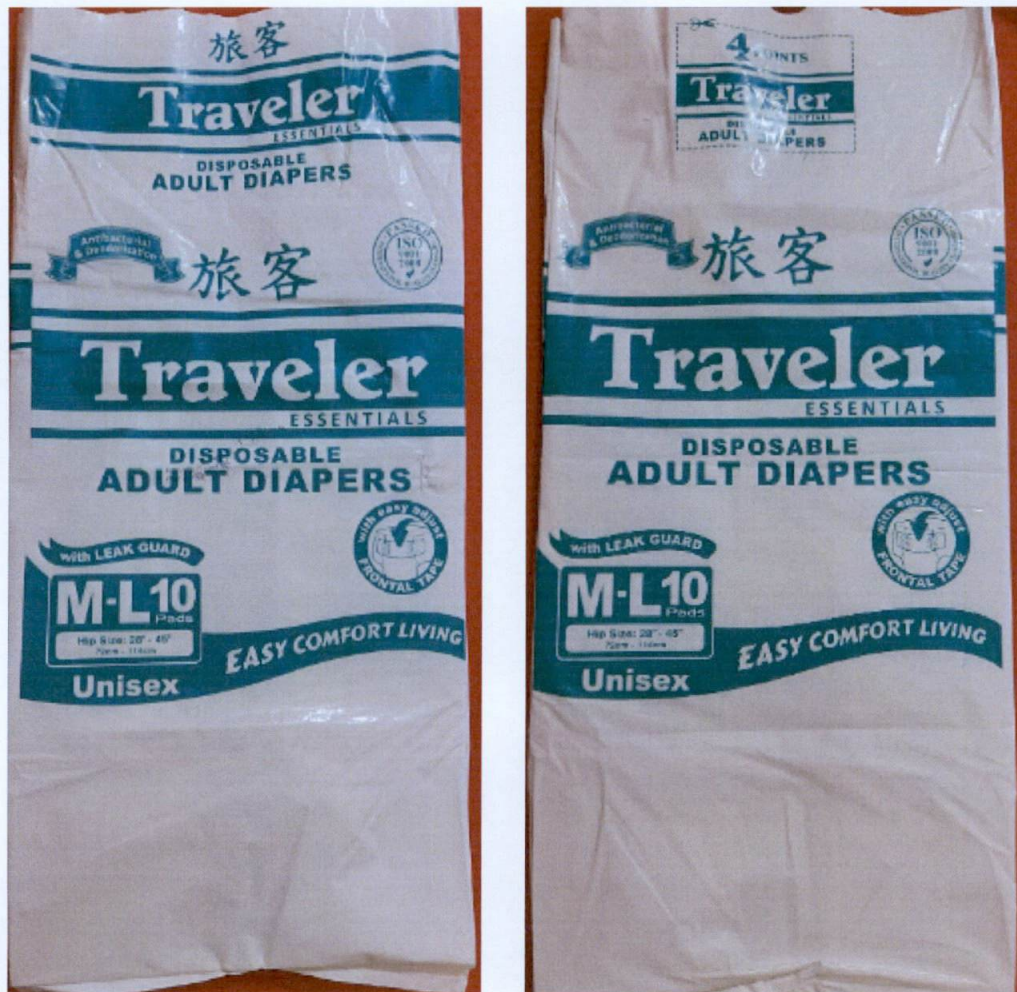
Figure 1. Unnotified Traveler Essentials Disposable Adult Diapers

The Food and Drug Administration (FDA) warns all healthcare professionals and the general public NOT TO PURCHASE AND USE the unnotified medical device products: