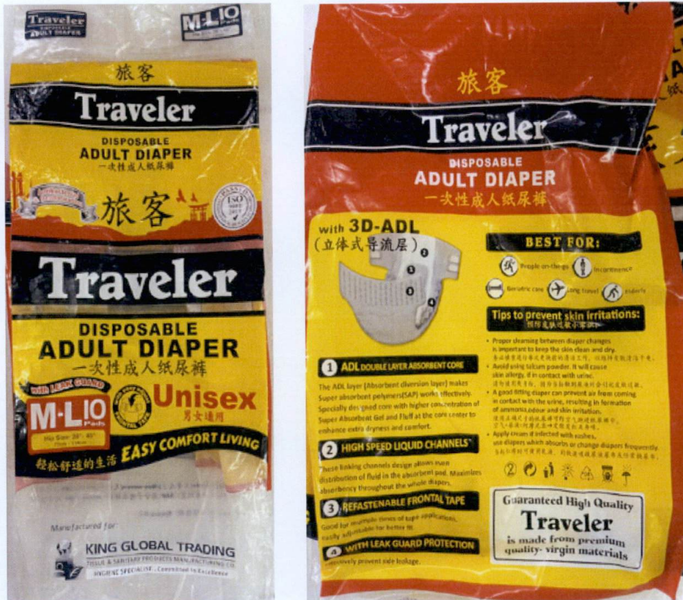
Figure 2. Unnotified Traveler Disposable Adult Diaper

The FDA verified through post-marketing surveillance that the abovementioned medical device products are not notified and no corresponding Product Notification Certificate have been issued. Pursuant to the Republic Act No. 9711, otherwise known as the “Food and Drug Administration Act of 2009”, the manufacture, importation, exportation, sale, offering for sale, distribution, transfer, non-consumer use, promotion, advertising or sponsorship of health products without the proper authorization is prohibited.