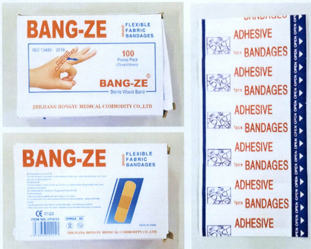
Figure 2. Unnotified Bang-Ze® Sterile Would Band

The FDA verified through post-marketing surveillance that the above mentioned medical device products are not notified and no corresponding Product Notification Certificates have been issued. Pursuant to the Republic Act No. 9711, otherwise known as the “Food and Drug Administration Act of 2009”, the manufacture, importation, exportation, sale, offering for sale, distribution, transfer, non-consumer use, promotion, advertising or sponsorship of health products without the proper authorization is prohibited.