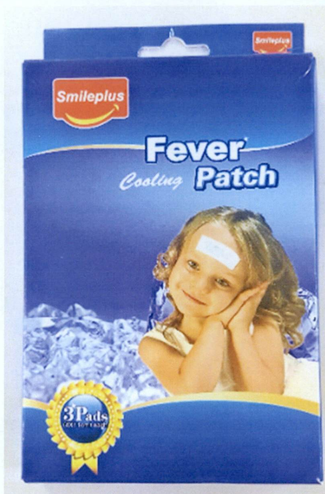
Figure 1. Unnotified Smileplus Fever Cooling Patch

The Food and Drug Administration (FDA) warns all healthcare professionals and the general public NOT TO PURCHASE AND USE the unnotified medical device products: