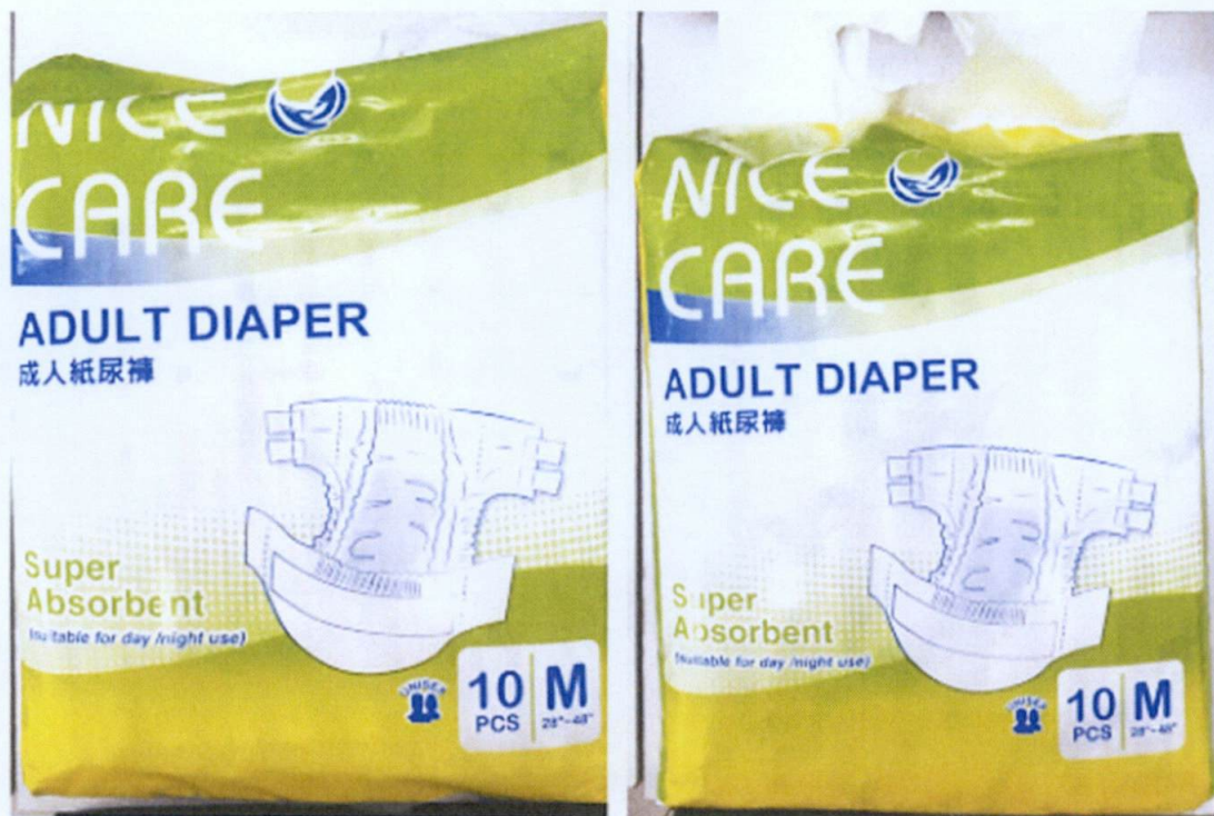
Figure 1. Unnotified Nice Care Adult Diaper (10 pcs, M)

The Food and Drug Administration (FDA) warns all healthcare professionals and the general public NOT TO PURCHASE AND USE the unnotified medical device product: