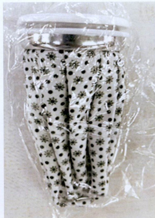
Figure 1. Unnotified INMED Ice Bag

The FDA verified through post-marketing surveillance that the abovementioned medical device product is not notified and no corresponding Product Notification Certificate has been issued. Pursuant to the Republic Act No. 9711, otherwise known as the "Food and Drug Administration Act of 2009", the manufacture, importation, exportation, sale, offering for sale, distribution, transfer, non-consumer use, promotion, advertising or sponsorship of health products without the proper authorization is prohibited.