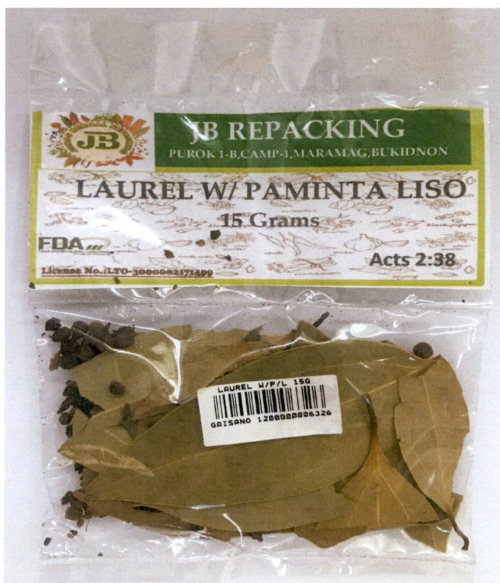
Figure 1. Unregistered JB REPACKING Laurel w/ Paminta Liso

The Food and Drug Administration (FDA) warns all healthcare professionals and the general public NOT TO PURCHASE AND CONSUME the unregistered food product: