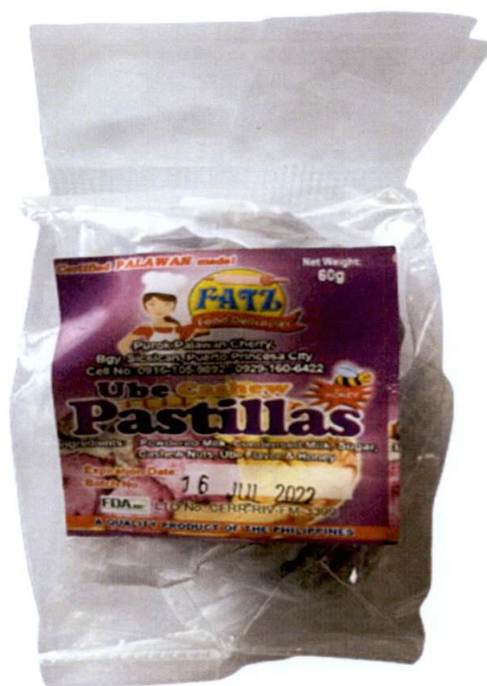
Figure 1. Unregistered FATZ FOOD DELICACIES Ube Cashew Pastillas

The Food and Drug Administration (FDA) warns all healthcare professionals and the general public NOT TO PURCHASE AND CONSUME the unregistered food product: