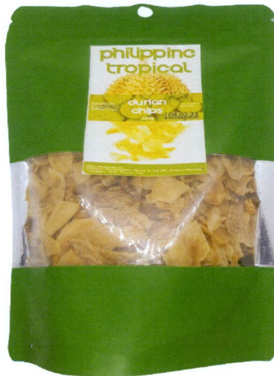
Figure 1. Unregistered PHILIPPINE TROPICAL Durian Chips

The Food and Drug Administration (FDA) warns all healthcare professionals and the general public NOT TO PURCHASE AND CONSUME the unregistered food product: