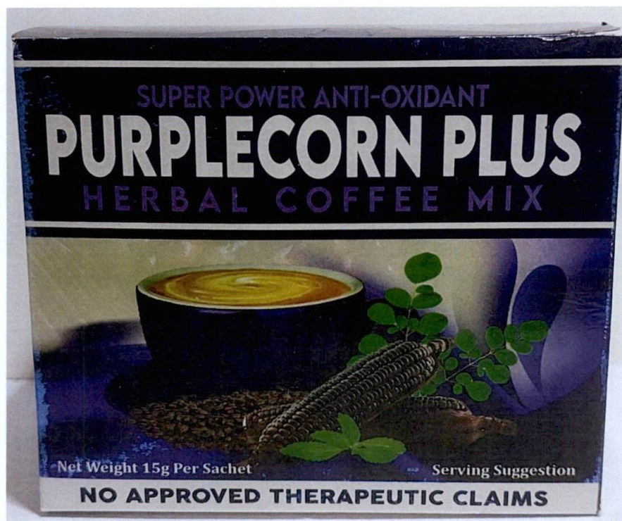
Figure 1. Unregistered SUPER POWER ANTI-OXIDANT Purplecorn Plus Coffee Mix (NO APPROVED THERAPEUTIC CLAIMS)

The Food and Drug Administration (FDA) warns all healthcare professionals and the general public NOT TO PURCHASE AND CONSUME the unregistered food product: