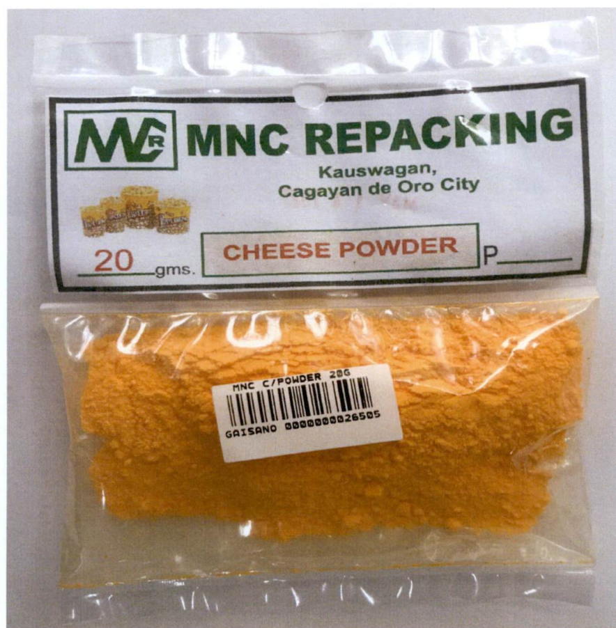
Figure 1. Unregistered MNC REPACKING Cheese Powder

The Food and Drug Administration (FDA) warns all healthcare professionals and the general public NOT TO PURCHASE AND CONSUME the unregistered food product: