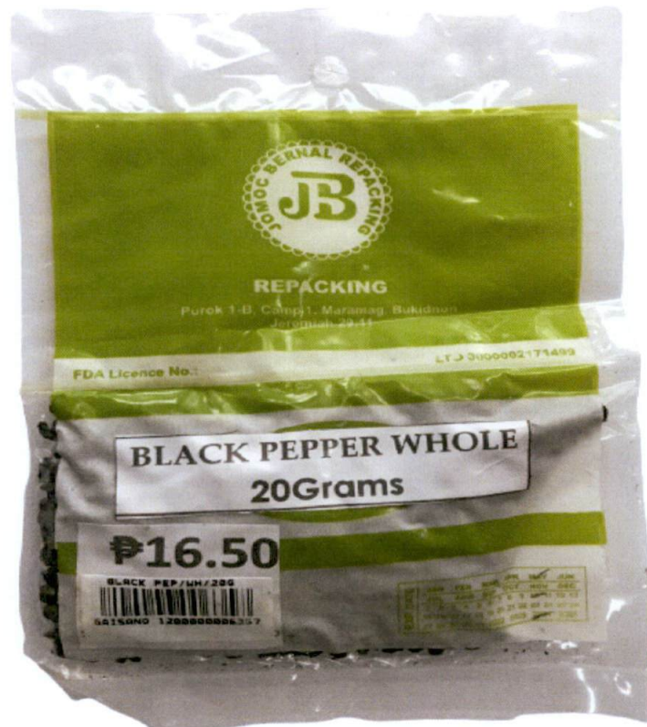
Figure 1. Unregistered JB REPACKING Black Pepper Whole

The Food and Drug Administration (FDA) warns all healthcare professionals and the general public NOT TO PURCHASE AND CONSUME the unregistered food product: