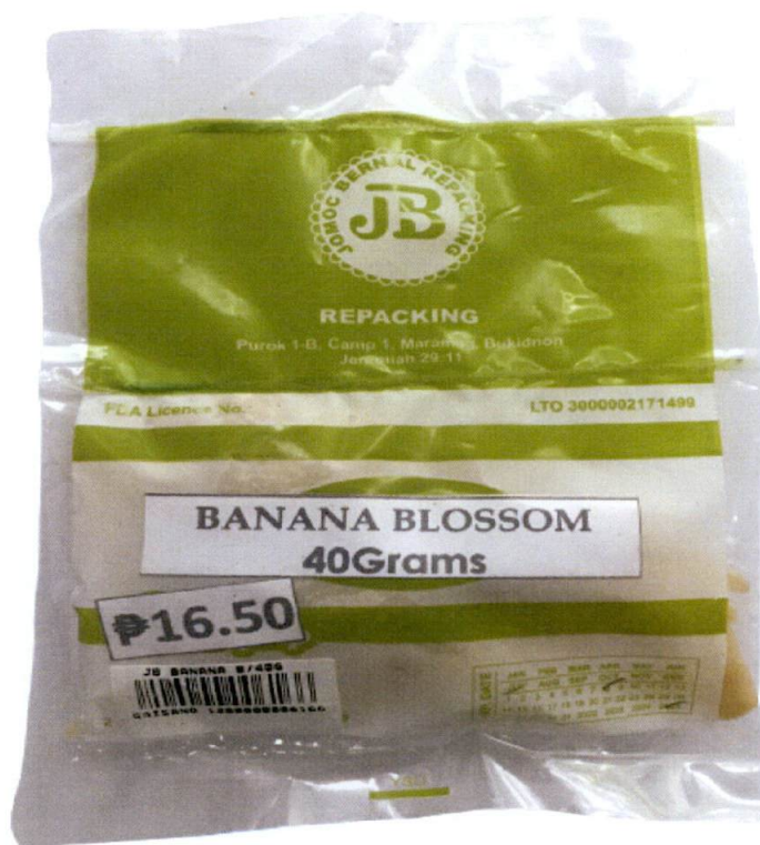
Figure 1. Unregistered JB REPACKING Banana Blossom

The Food and Drug Administration (FDA) warns all healthcare professionals and the general public NOT TO PURCHASE AND CONSUME the unregistered food product: