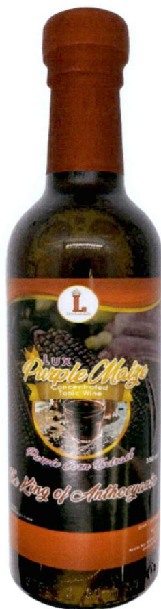
Figure 1. Unregistered LIVELUXLIFE LUX Purple Maize Purple Corn Extract

The Food and Drug Administration (FDA) warns all healthcare professionals and the general public NOT TO PURCHASE AND CONSUME the unregistered food product: