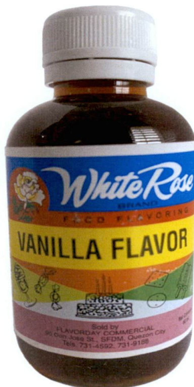
Figure 1. Unregistered WHITE ROSE BRAND Food Flavoring Vanilla Flavor

The Food and Drug Administration (FDA) warns all healthcare professionals and the general public NOT TO PURCHASE AND CONSUME the unregistered food product: