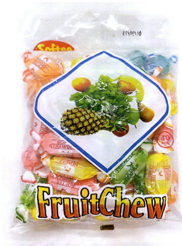
Figure 1. Unregistered SOFTEE Fruit Chew

The Food and Drug Administration (FDA) warns all healthcare professionals and the general public NOT TO PURCHASE AND CONSUME the unregistered food product: