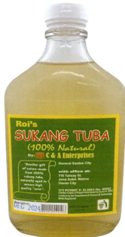
Figure 1. Unregistered ROI'S Sukang Tuba

The Food and Drug Administration (FDA) warns all healthcare professionals and the general public NOT TO PURCHASE AND CONSUME the unregistered food product: