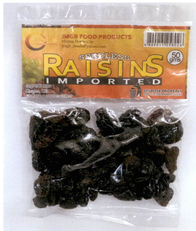
Figure 1. Unregistered JMGB FOOD PRODUCTS Seedless Raisins

The Food and Drug Administration (FDA) warns all healthcare professionals and the general public NOT TO PURCHASE AND CONSUME the unregistered food product: