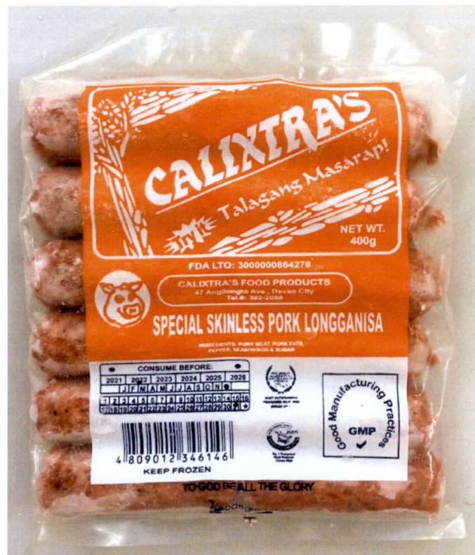
Figure 1. Unregistered CALIXTRA'S Special Skinless Pork Longganisa

The Food and Drug Administration (FDA) warns all healthcare professionals and the general public NOT TO PURCHASE AND CONSUME the unregistered food product: