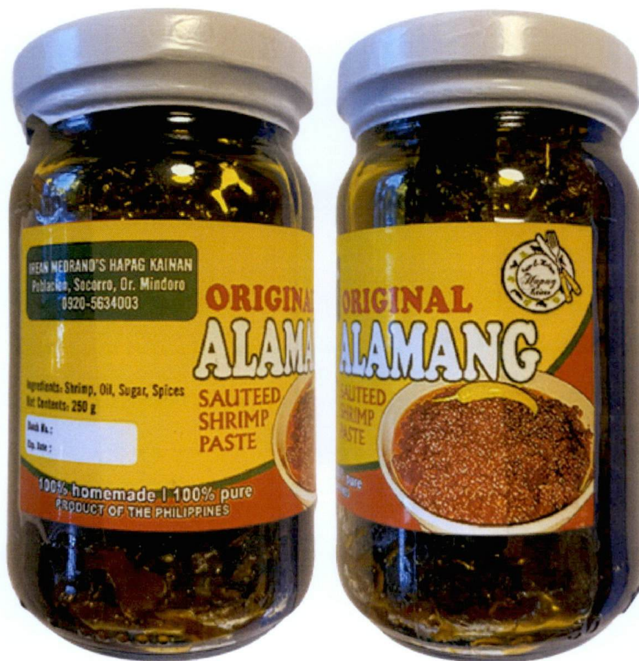
Figure 1. Unregistered IREAN MEDRANO'S HAPAG KAINAN Original Alamang Sauteed Shrimp Paste

The Food and Drug Administration (FDA) warns all healthcare professionals and the general public NOT TO PURCHASE AND CONSUME the unregistered food product: