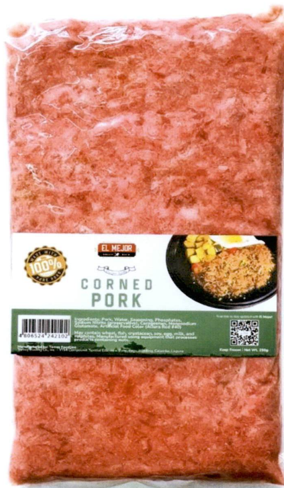
Figure 1. Unregistered EL MEJOR Corned Pork

The Food and Drug Administration (FDA) warns all healthcare professionals and the general public NOT TO PURCHASE AND CONSUME the unregistered food product: