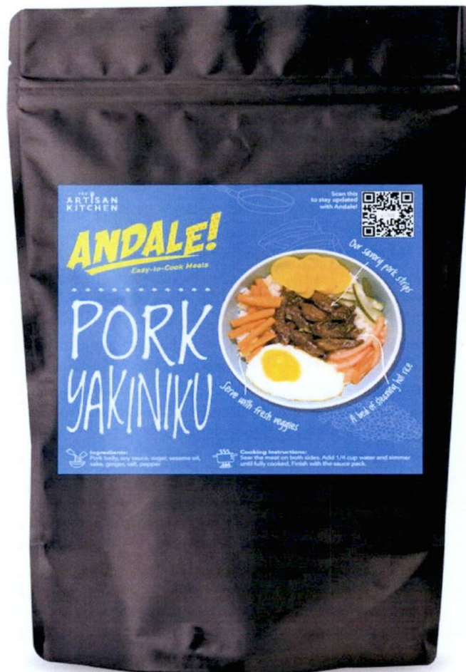
Figure 1. Unregistered THE ARTISAN KITCHEN Andale Easy-to-Cook Meals - Pork Yakiniku

The Food and Drug Administration (FDA) warns all healthcare professionals and the general public NOT TO PURCHASE AND CONSUME the unregistered food product: