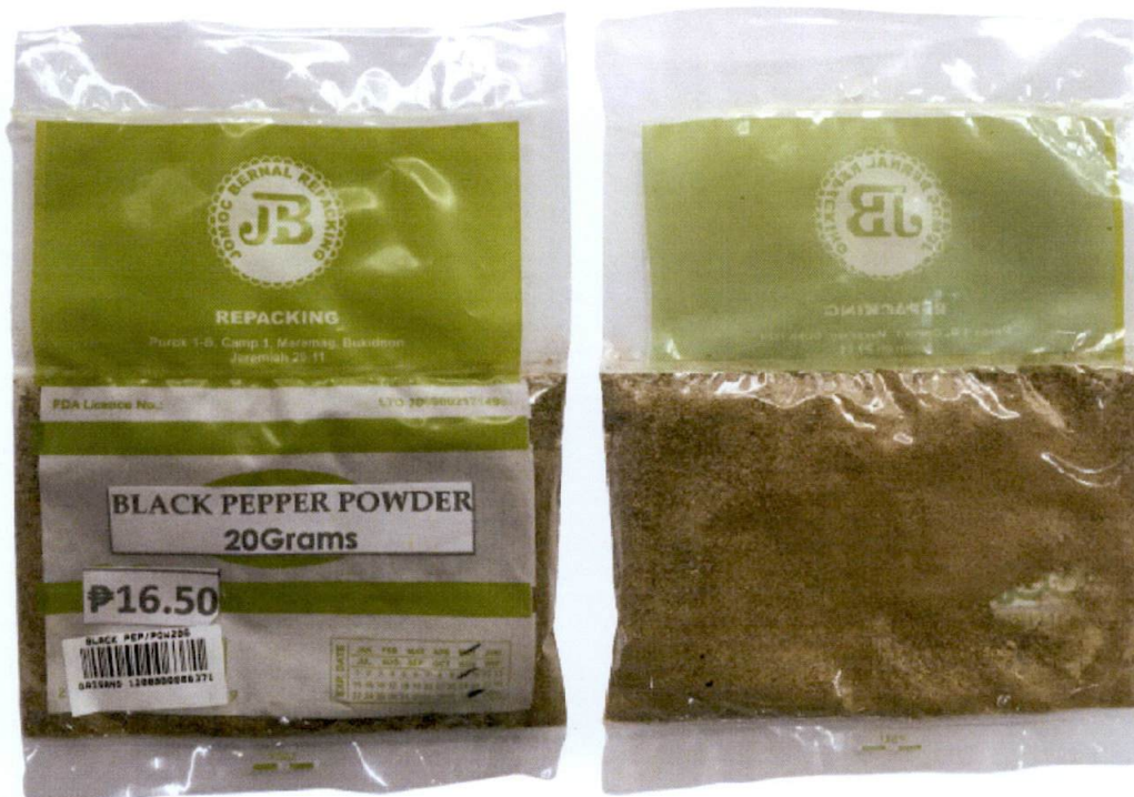
Figure 1. Unregistered JB REPACKING Black Pepper Powder

The Food and Drug Administration (FDA) warns all healthcare professionals and the general public NOT TO PURCHASE AND CONSUME the unregistered food product: