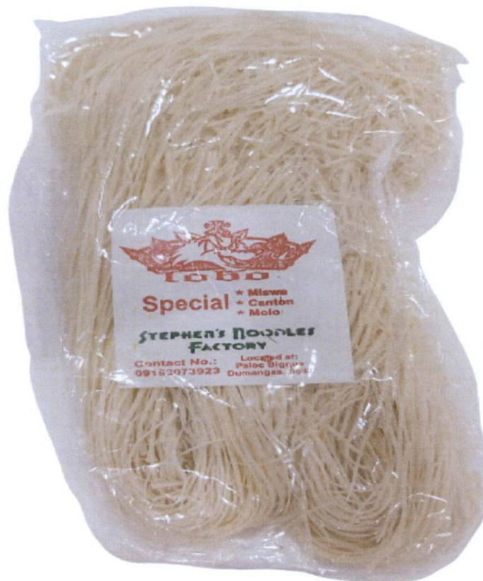
Figure 1. Unregistered LOBO MISWA

The Food and Drug Administration (FDA) warns all healthcare professionals and the general public NOT TO PURCHASE AND CONSUME the unregistered food product: