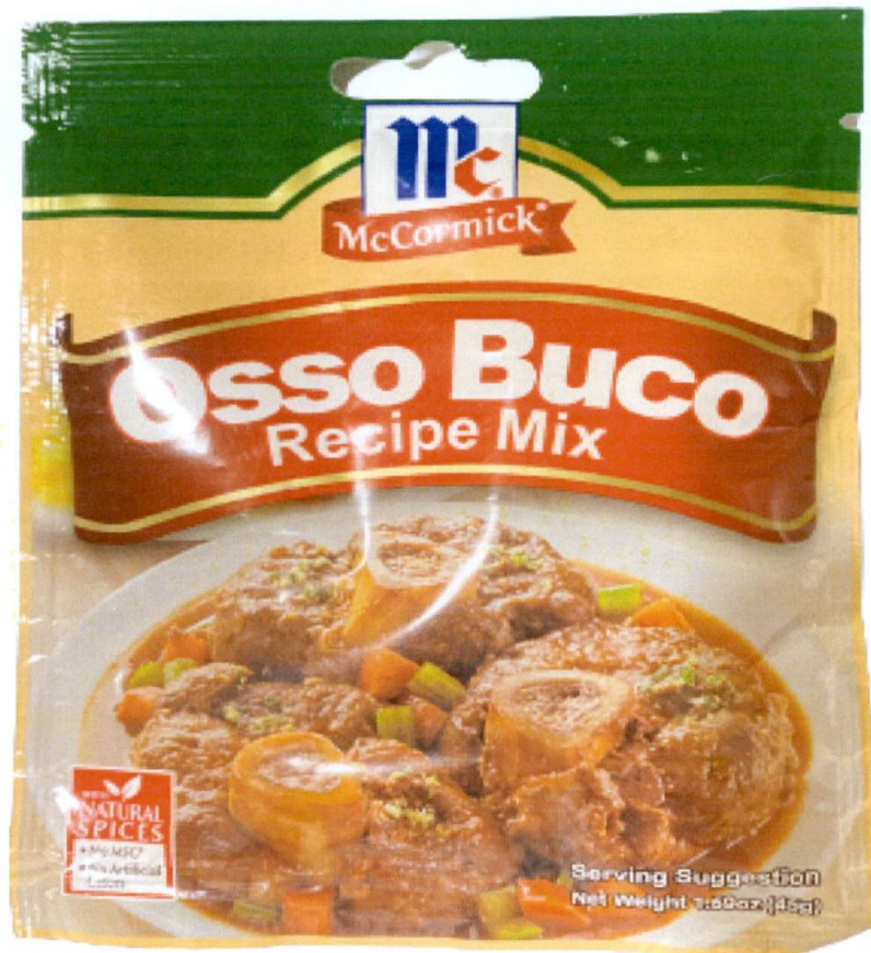
Figure 1. Unregistered MC CORMICK Osso Buco Recipe Mix

The Food and Drug Administration (FDA) warns all healthcare professionals and the general public NOT TO PURCHASE AND CONSUME the unregistered food product: