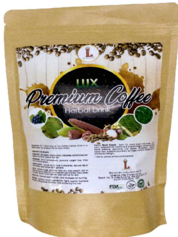
Figure 1. Unregistered LIVELUXLIVE LUX Premium Coffee Herbal Drink

The Food and Drug Administration (FDA) warns all healthcare professionals and the general public NOT TO PURCHASE AND CONSUME the unregistered food product: