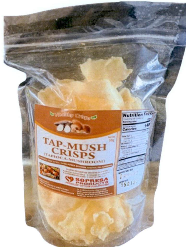
Figure 1. Unregistered HEALTHY CRISPS Tap-Mush Crisps (Tapioca-Mushroom)

The Food and Drug Administration (FDA) warns all healthcare professionals and the general public NOT TO PURCHASE AND CONSUME the unregistered food product: