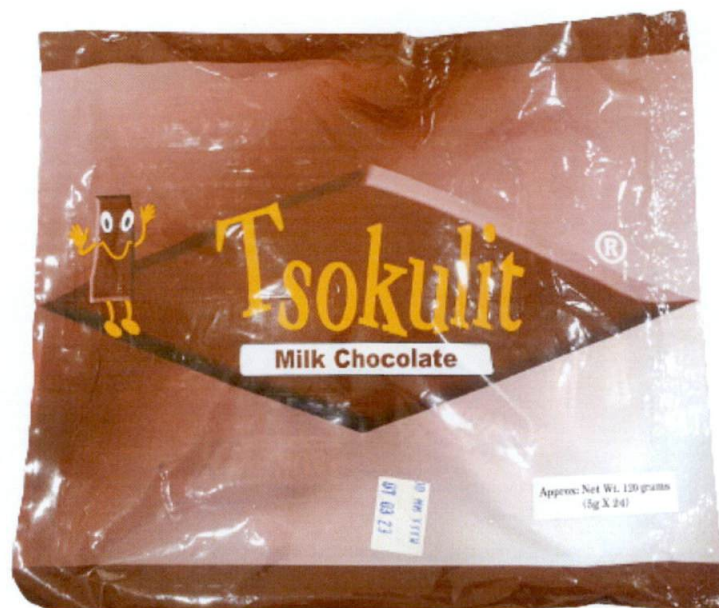
Figure 1. Unregistered TSOKULIT Milk Chocolate

The Food and Drug Administration (FDA) warns all healthcare professionals and the general public NOT TO PURCHASE AND CONSUME the unregistered food product: