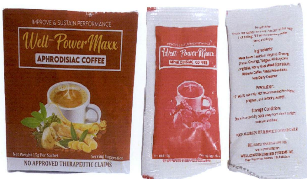
Figure 1. Unregistered WELL-POWER MAXX Aphrodisiac Coffee (NO APPROVED THERAPEUTIC CLAIMS)

The Food and Drug Administration (FDA) warns all healthcare professionals and the general public NOT TO PURCHASE AND CONSUME the unregistered food product: