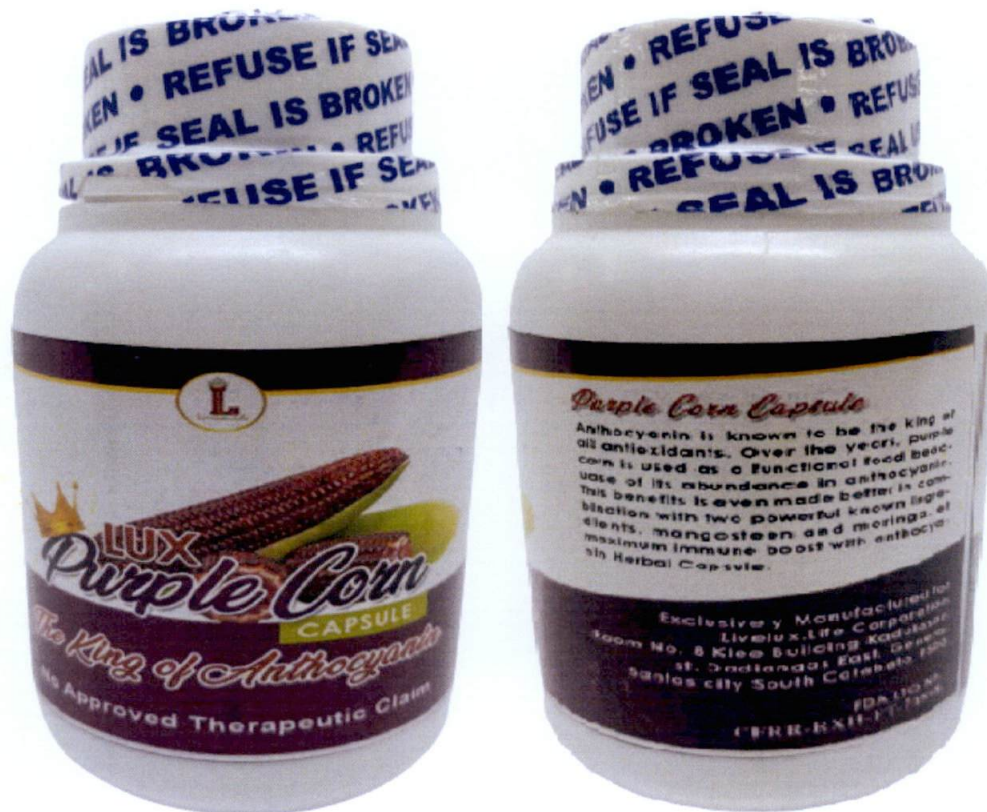
Figure 1. Unregistered LUX Purple Corn Capsule (No Approved Therapeutic Claim)

The Food and Drug Administration (FDA) warns all healthcare professionals and the general public NOT TO PURCHASE AND CONSUME the unregistered food supplement: