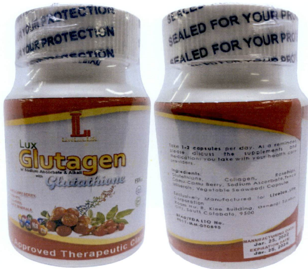
Figure 1. Unregistered LIVELUXLIFE LUX Glutagen w/ Sodium Ascorbate & Alkali with Glutathione

The Food and Drug Administration (FDA) warns all healthcare professionals and the general public NOT TO PURCHASE AND CONSUME the unregistered food product: