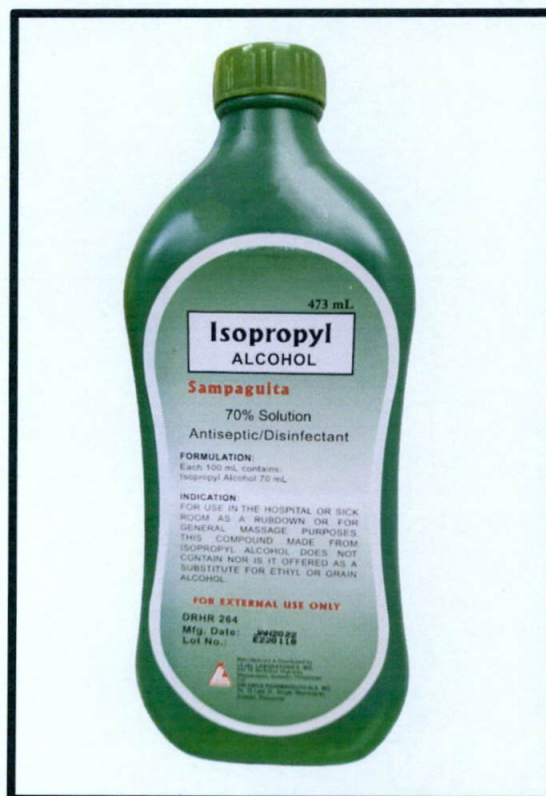
Figure 1. Isopropyl Alcohol 70% Solution [Sampaguita] for Recall